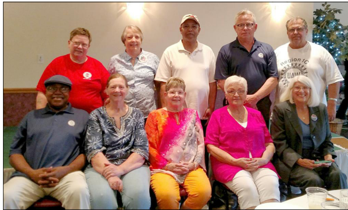
Shown here at the annual retirees luncheon are the board members for the Region 1D Lansing Area Retirees Council. Thanks to them and to everyone who helped or attended for another fine time!