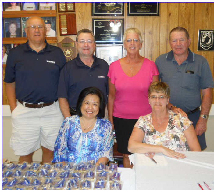
The Local 652 Florida picnic was held in February. You can see more pictures in the article archives on our website.

WANTED: your old 45 rpm records. Are you between the ages of 60 and 80 and have a collection of records you don't play anymore? Or do you know someone who has an old 45 collection? I might be interested in buying them. Call me at 517/775-3989 or 517/645-2508.