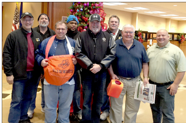
Local UAW members, including many local union officers, were at the plant gates and other locations in December, collecting money for the Old Newsboys' drive, which raises funds for warm clothes for children who need them. Here are shown some of the collectors at the main LAFCU office.