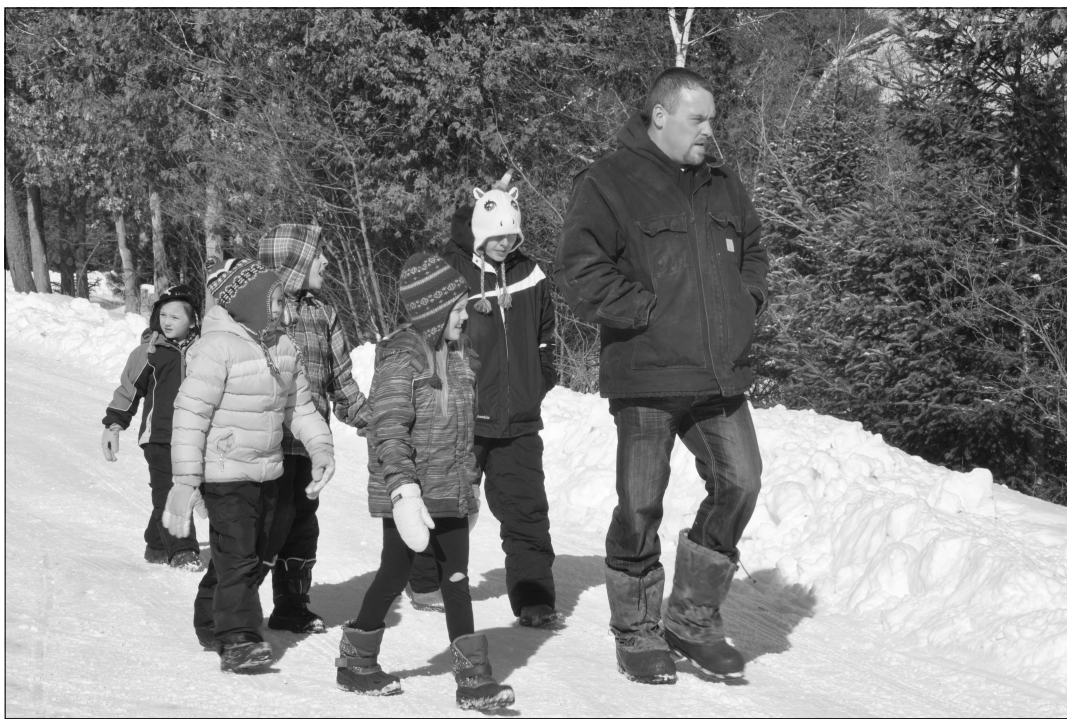
The Oldsmobile Outdoor Club's Winterfest is fun for all ages! Bring the kids and grandkids!