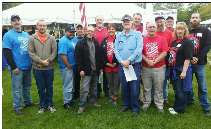
Volunteers and veterans at the annual Volunteers of America Stand Down for Homeless Veterans, which provides goods and services of various kinds to veterans in need.

The Labor News is also available online at lansinglabornews.org