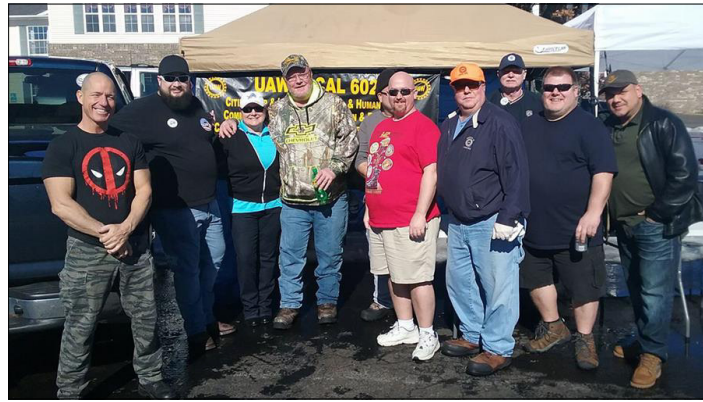
The 602 chili crew at Winterfest 2017 on February 20. Obviously not as wintry as some years, but still plenty of fun!

sing, on April 28, at Local 602, 2510 W Michigan. The third tournament will be in Flint, on May 5, at Local 659, 4549 Van Slyke Rd. All tournaments start at 10:00 a.m. Arrive early to sign in and get seated so the games can start on time. You do not need a partner to play. You are welcome to play at all the tournaments if you like.