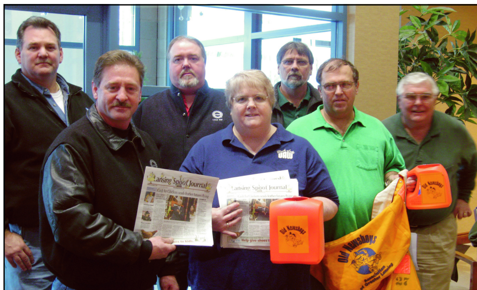
Local UAW members and leaders sold the Old Newsboy spooft newspaper in December to raise money for needy children.

At the Lansing Grand River plant, the target date for launching our new CTS Coupe and CTS Coupe V regular production will be May of 2010. Thanks to our members for all the hard work you do to make sure we have a successful launch!