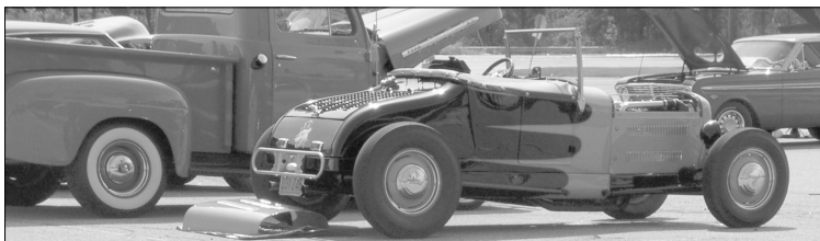
BELOW: A scene from the Local 1753 car show.