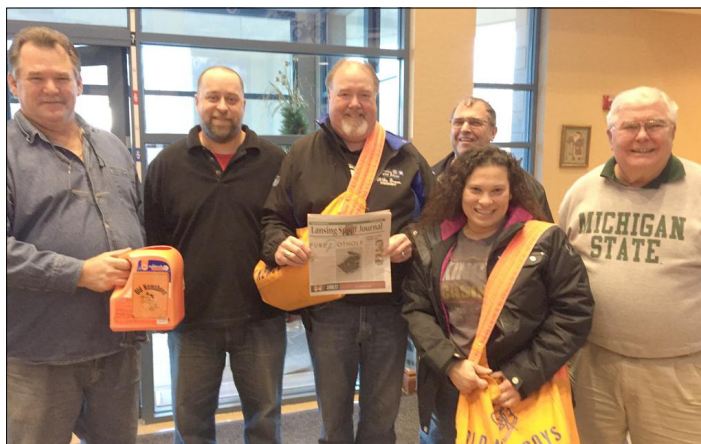
Local 652 officers and members collecting money for the Old Newsboys drive in December.

soning of Flint's drinking water? And Detroit schools with floors demolished, mice running around in the school, and security doors rusted with no money to repair them!