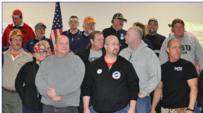
Local officers and committee members at Winterfest 2014. This year's Winterfest will be February 13-15 in Grayling. See page 2 for more info.