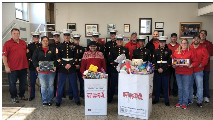
Local 652 officers and members with U.S. Marines, kicking off the annual Toys-for-Tots campaign. Our members were again very generous in helping to provide a good Christmas for local children in need. Thanks to all who contributed!

in making the Lansing Labor News what it is today, I wish you the best in your retirement; our UAW Local 602 standing committees who give up their personal time to host events, educate and provide services to our members, their families and friends; the officers and staff I have the pleasure of working with every day as well as our Local's chairman, members of the shop committee, districts, alternates and appointed.