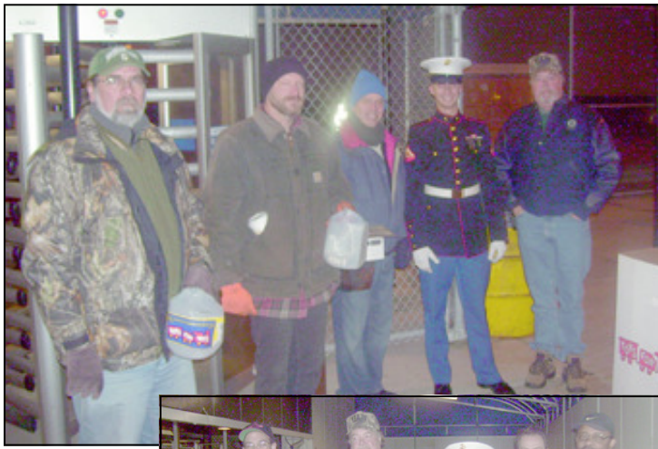
Local 652 officers and members are shown here with local Marines collecting money at the plant gates for Toys for Tots.