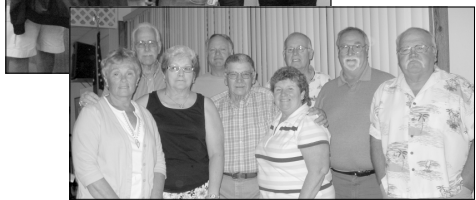
Below: Local 1753 retirees at the same picnic.