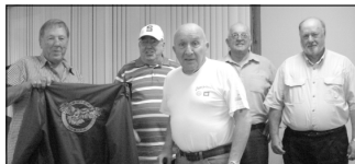
Left: Local 1618 retirees at this year's Florida picnic, with a Reatta jacket.