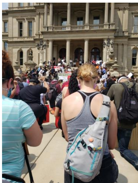
June 10th Lansing chapter NAACP march at the State Capital. UAW Local 602 was in attendance