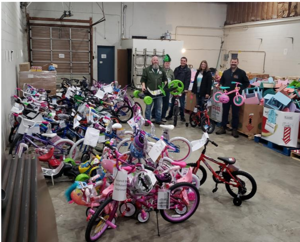
Members of the area locals never hesitate to help out those in need, especially the children